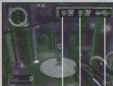
Primary Weapons Secondary Weapons Bio-augmentations

The inventory has three categories: Primary Weapons , Secondary Weapons and Bio-augmentations . All inventory items must be acquired.